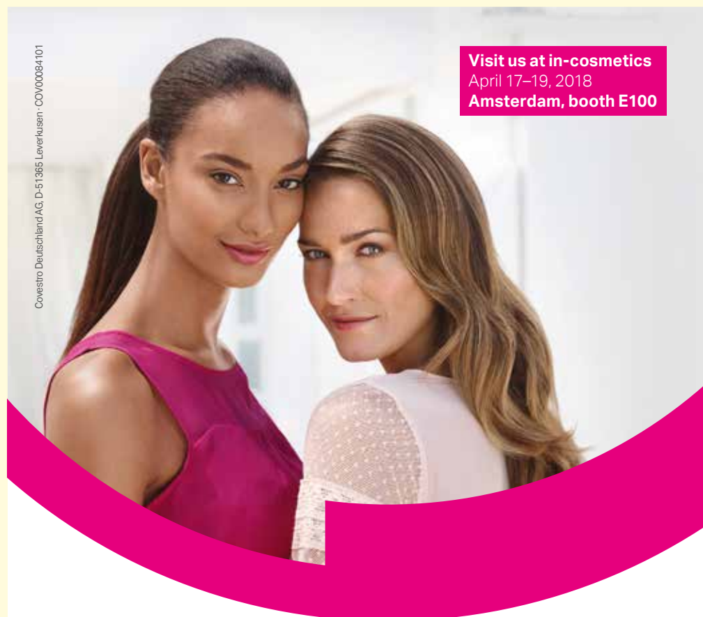
Covestro Deutschland AG, D-51365 Leverkusen, COV00084101

the trade for their livelihoods. The stand will feature a supporting interactive play area dedicated to 'Innovations with Shea'. ■